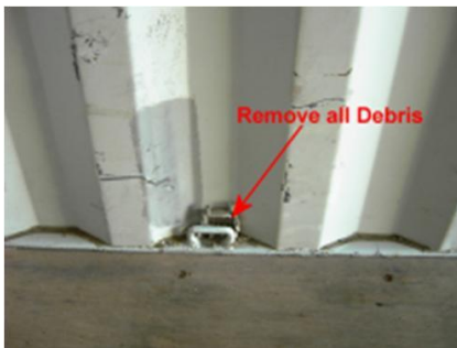
Debris behind lashing points