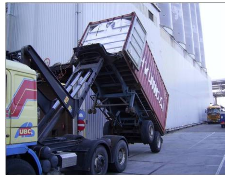
Tilting Trailer Chassis