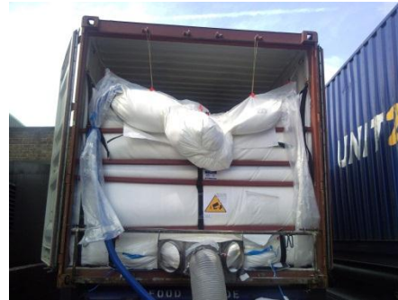
Tilting too quickly