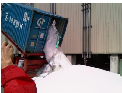
Burst liner with contents spilt

The following images are examples of unsafe containers, wrongful use and unsuitable liners and bulkheads and the likely consequences to these guidelines not being followed: