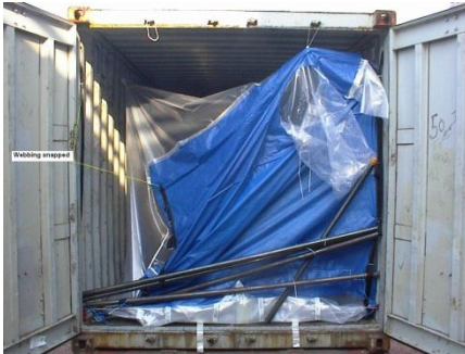
Result of badly fitted bulkheads and bars