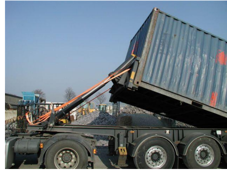
Container fallen off trailer