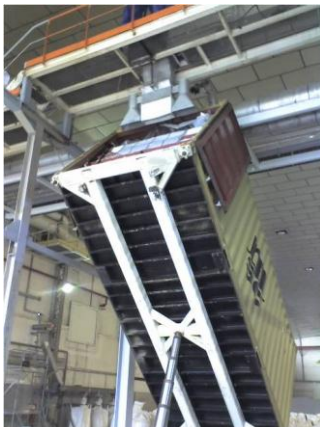
Trailer with tilting ram

The following are differing types of loading equipment for gravity feeding of product into the container, through the end doors: