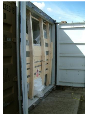
Snapped Wooden Bulkhead

The above emphasises the need for training of operators within the supply chain and the continuing risk assessment of all activities associated within the supply chain. These should cover: