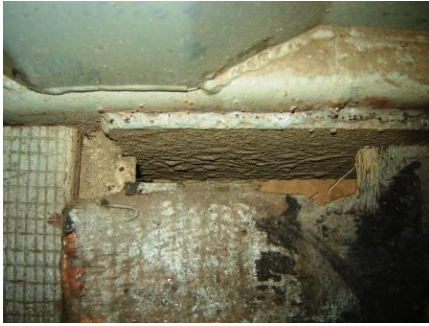
Rusty Damaged Floor