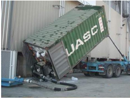
Container fallen off trailer