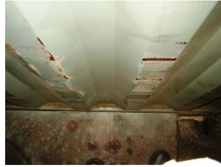
Sharp dents on walls