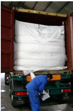
Trapped discharge sleeve