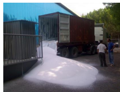
Container with contents spilt & liner down